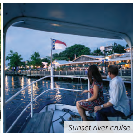
Sunset river cruise