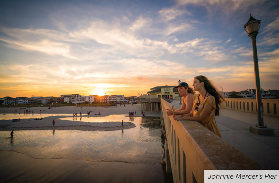
Johnnie Mercer's Pier

A great starting point is the Bob Jenkins Riverfront Visitor Information booth at Market and Water streets. Helpful staffers can direct you to Segway tours, horse-drawn carriage rides, guided walking tours, live music and craft breweries.