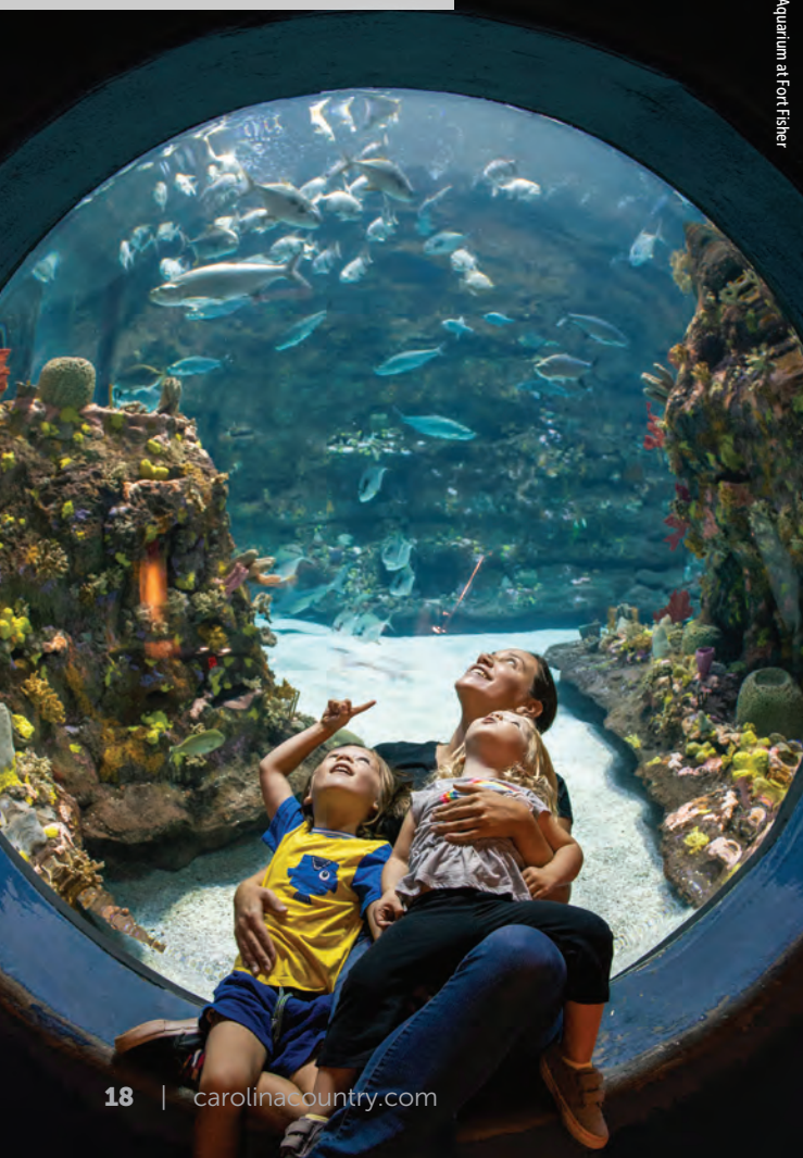
NC Aquarium at Fort Fisher