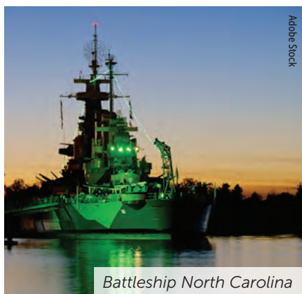
Battleship North Carolina

+ carolinacountry.com/extras Check out the online version of this article for links to more information about all of the mentioned sites and locations.