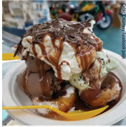
Surfer's Special from Celtic Creamery